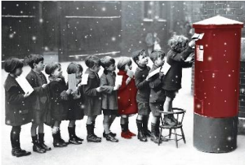
Letters to Santa – 10 cards per pack (Item code: LTS)