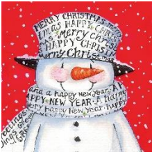
Festive Snowman – 10 cards per pack (Item code: FS)

All profits from the sale of these cards will be donated to the Pelvic Partnership, thank you for supporting us!