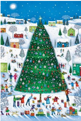
Decorating the tree – 10 cards per pack (Item code: DTT)